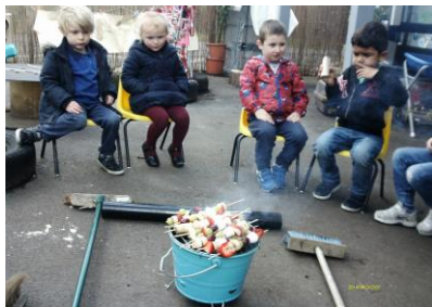
Snack time outside