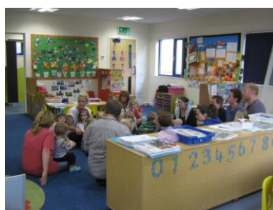
Parents open afternoon