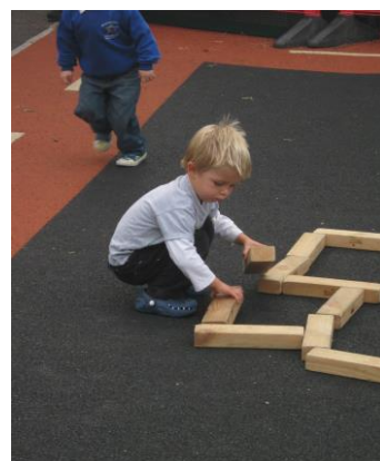
Great problem solving