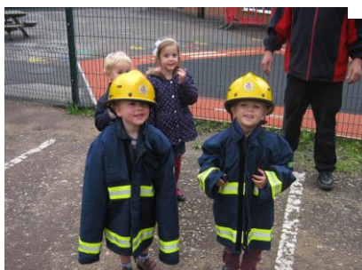
A visit from the fire service