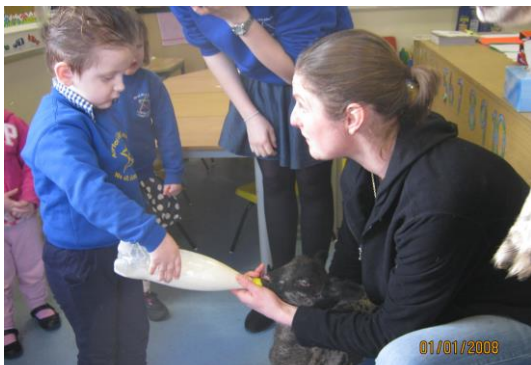
A visit from a parent vet