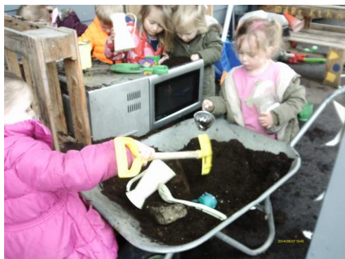
Learning through play