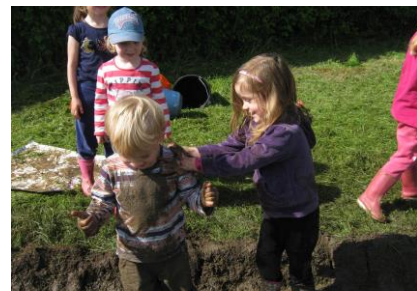
Muddy welly Wednesday