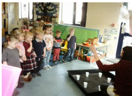
Fun, stimulating activities